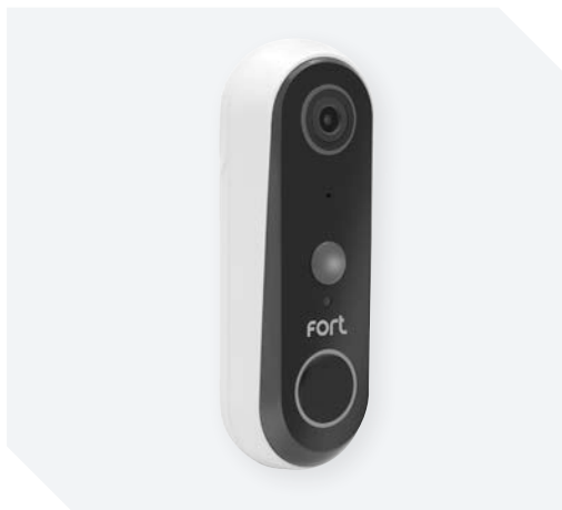
ECSPDB Smart Security Doorbell