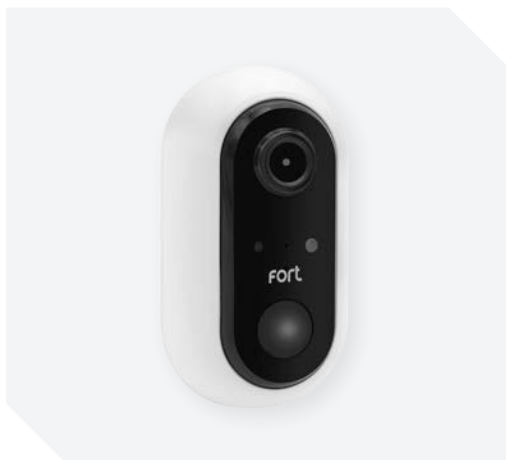
ECSPCAM65 Smart Security External Camera