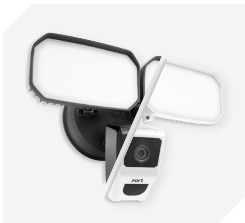
ECSPCAMFLW WHITE ECSPCAMFLB BLACK Smart Security Spotlight Camera