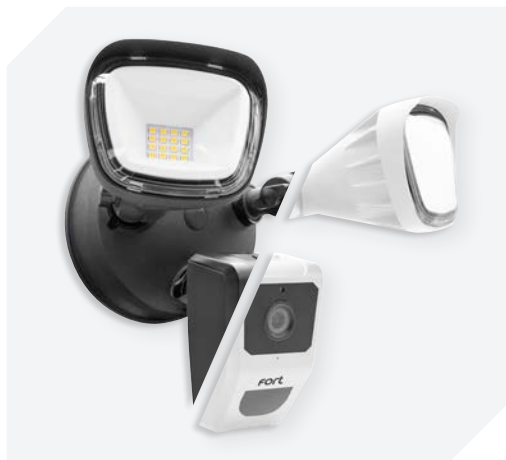
ECSPCAMSLW WHITE ECSPCAMSLB BLACK Smart Security Floodlight Camera