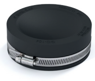
End Cap PlumbQwik ™