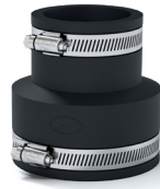
Adaptor PlumbQwik ™