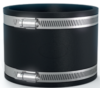
Straight PlumbQwik ™

pipe alignment, making them ideal for repair scenarios and rectifying previous bad workmanship. The product range covers all common pipe sizes as straight or adaptor (also known as reducer) applications.