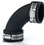
Elbow PlumbQwik ™