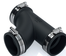
Tee PlumbQwik ™